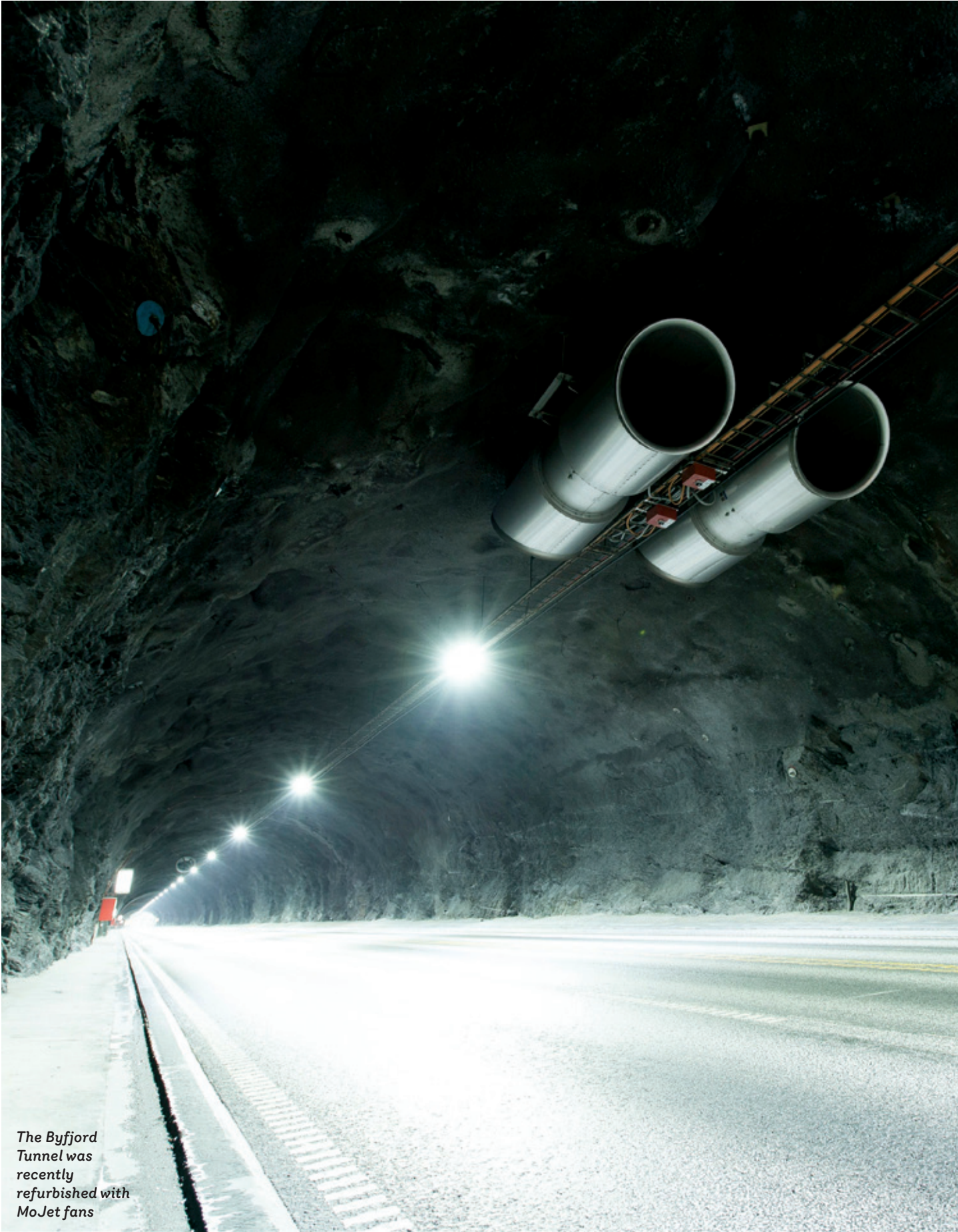
The Byfjord Tunnel was recently refurbished with MoJet fans